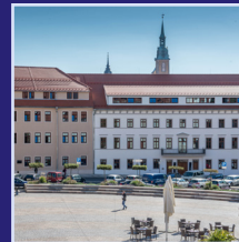
TU Bergakademie Freiberg