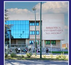
Universidad de León