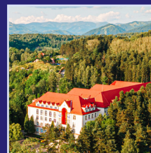
Universitatea din Petroșani